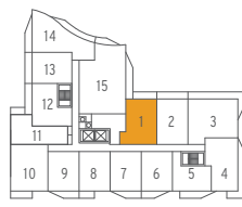
LEVEL 08 & 10